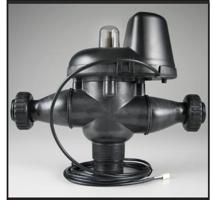
Order No. V3069MM • M x M

1 " & 1.25 " Motorized Alternating Valve